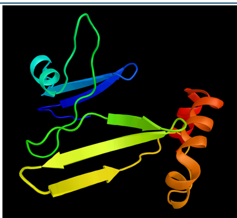
Ghrelin is the only known hormone that stimulates appetite.

Ghrelin's potent effects led to a flurry of research on ghrelin-blocking molecules as a new route to potential antiobesity drugs. But, in animal studies, even when ghrelin antagonists were found to be safe and block the hormone's activity, they failed to treat obesity. "No one has designed a ghrelin receptor antagonist that actually suppresses feeding behavior", says Roy Smith of The Scripps Research Institute in Florida.