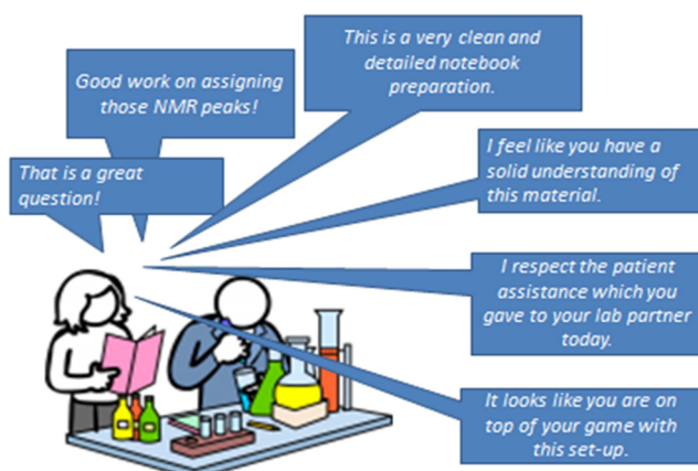
Figure 2. Giving positive feedback is a simple element of supportive communication.

Avoid using judgmental statements: You set up an unstable apparatus because you did not stabilize the condenser with a clamp.