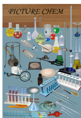
Figure 2. Playing board of the Picture Chem game.

This game is played with two players or teams. If the game is played with teams in the class, the teacher should divide class into two teams before starting the game. Then, it is decided who goes first. The starting team could be determined by lots or other convenient and fair methods.