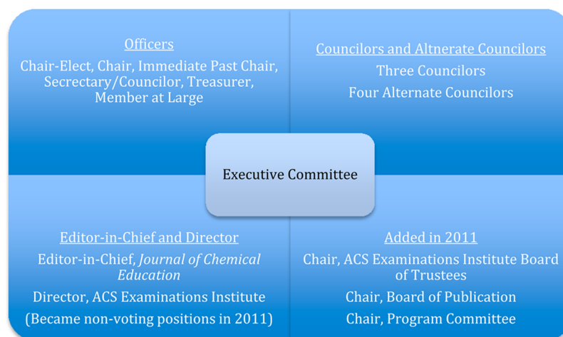
Figure 2. Members of the Division of Chemical Education Executive Committee. Members of the Division elect the Officers, Councilors, and Alternate Councilors. The Board of Publication appoints the Editor of the Journal of Chemical Education and the ACS-EI Board of Trustees appoints the Director. The Executive Committee appoints the Program Chair. The Board Chairs are members of the respective boards via appointments from the Executive Committee and are chosen as chair by the members of each Board.

the officers of the Division—the Chair, Chair-Elect, Immediate Past Chair, Secretary, Treasurer, and Member at Large—shall be members of the ACS and the Division of Chemical Education. 2 The Executive Committee has four Councilors (the Secretary is one of these four) and four Alternate Councilors who may represent the Division at ACS Council meetings. The Editor-in-Chief of the Journal of Chemical Education and the Director of the ACS-EI are also nonvoting members of the Executive Committee as they represent management of the business functions of the Division.